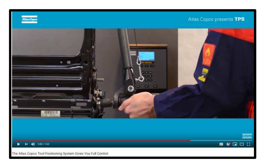
The Atlas Copco Tool Positioning System Gives You Full Control (https://www.youtube.com/watch?v=1Uywl6Rp3vo; also viewable at https://www.atlascopco.com/en-us/itba/products/assembly-solutions/Workplacesolutions-automation/torque-arms-and-tool-positioning).

38. On information and belief, each of the first and second fastening locations of Defendants' first and second physically separate components consists of a single opening for receiving a single fastener that, when fastened in the single opening by Defendants' Assembly Operations, partially assembles the first and second components together. For example, when a bolt is fastened into one of two available holes, this fastening partially assembles the components together. See :