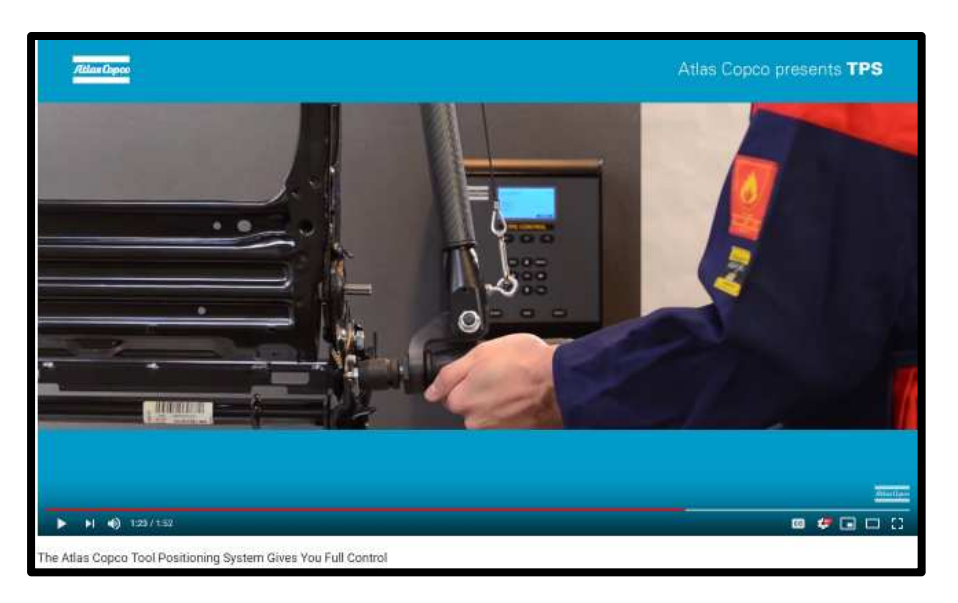
The Atlas Copco Tool Positioning System Gives You Full Control (https://www.youtube.com/watch?v=1Uywl6Rp3vo; viewable also at https://www.atlascopco.com/en-us/itba/products/assembly-solutions/Workplacesolutions-automation/torque-arms-and-tool-positioning).

43. On information and belief, Defendants provide one or more sensors for sensing the position of the fastening tool. For example, when the operator for Defendants' Assembly Operations moves the fastening tool, which can be mounted on the end of a reaction arm, the one or more sensors generate signals that allow the control system to compute the position of the operating end of the fastening tool.