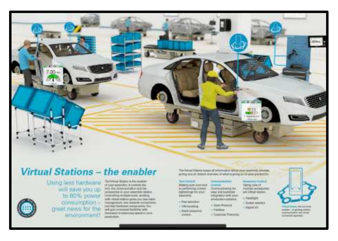
Atlas Copco, Smart Connected Assembly, Empowering the vision of Industry 4.0" at 11 (<u>https://www.atlascopco.com/content/dam/atlas-copco/industrial-</u>technique/general/documents/catalogs/Smart%20Connected%20Assembly%20Catalog.pdf).

35. Atlas Copco provides, for example, tooling that includes a torque arm to control