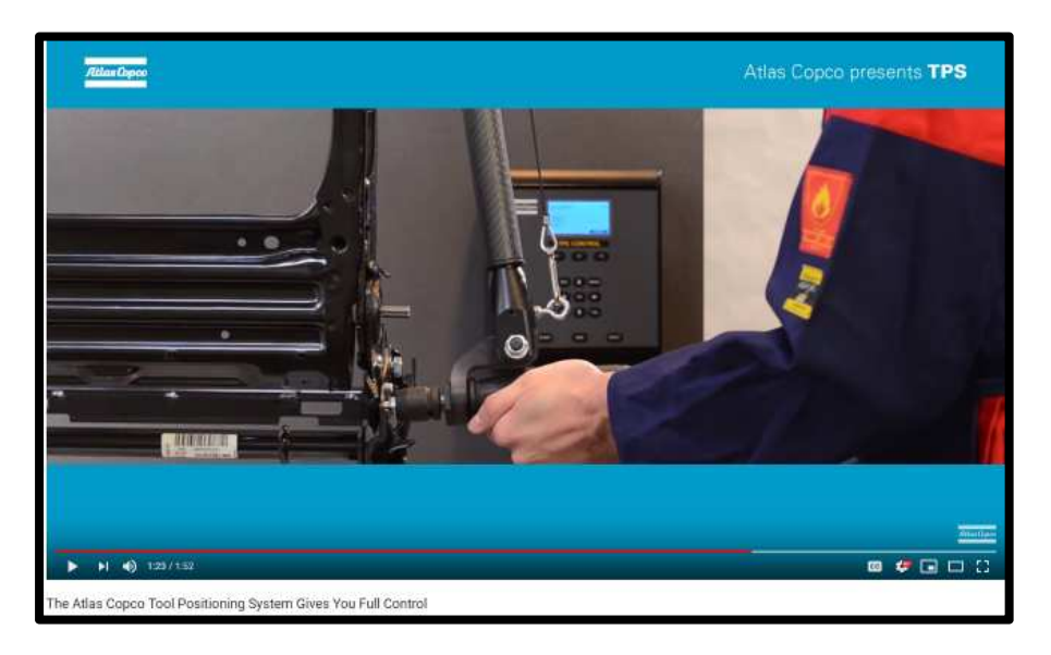
The Atlas Copco Tool Positioning System Gives You Full Control (<u>https://www.youtube.com/watch?v=1Uywl6Rp3vo;</u> also viewable at

both the fastening sequence and the torque applied to the fasteners: