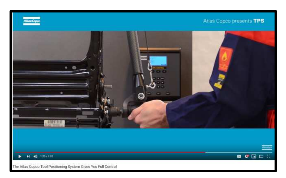
Full The Atlas Copco Tool Positioning System Gives You Control (https://www.youtube.com/watch?v=1Uywl6Rp3vo; viewable also at https://www.atlascopco.com/en-us/itba/products/assembly-solutions/Workplacesolutions-automation/torque-arms-and-tool-positioning).

assembled combination that would result if the operator were allowed to insert a fastener in the second fastening location when the torque applied to the first fastener does not equal the first predetermined torque value, (c) measure torque applied to a fastener by the fastening tool as it is being inserted in the second fastening location and then compare the measured torque to the second predetermined torque value, and (d) require that the torque applied to the fastener located in the second fastening location equal the second predetermined torque value, and the first fastener location at the first fastener has been inserted in the first fastening location at the first predetermined torque value, which reduces the risk of structural failure of the assembled combination that would result if the operator were allowed to complete assembly of the first and second components when the torque applied to the fastener inserted in the second fastening location did not equal the second predetermined torque value. For example, as explained above, Defendants' Assembly Operations ensure on a fastener-by-fastener basis that the correct torque is applied to each fastener: